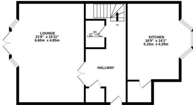
GROUND FLOOR 753 sq.ft. (69.9 sq.m.) approx.